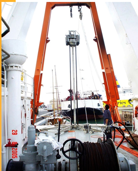
From the stern using the A-frame plus hoisting winch