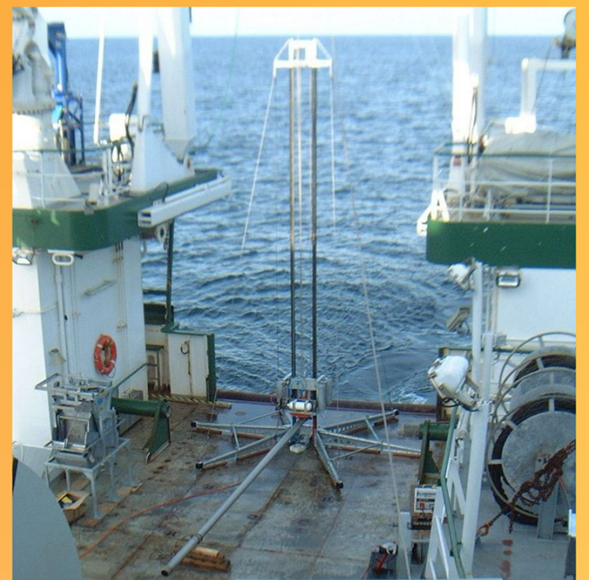
Ideal conditions with ample deck space