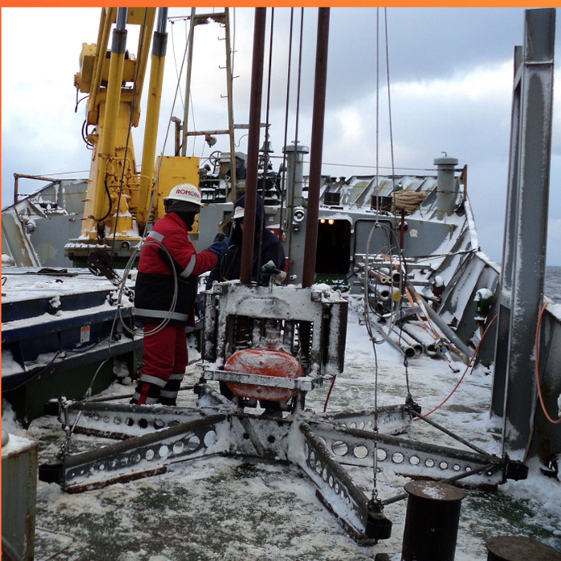
Deployment over the side with very little free deck space