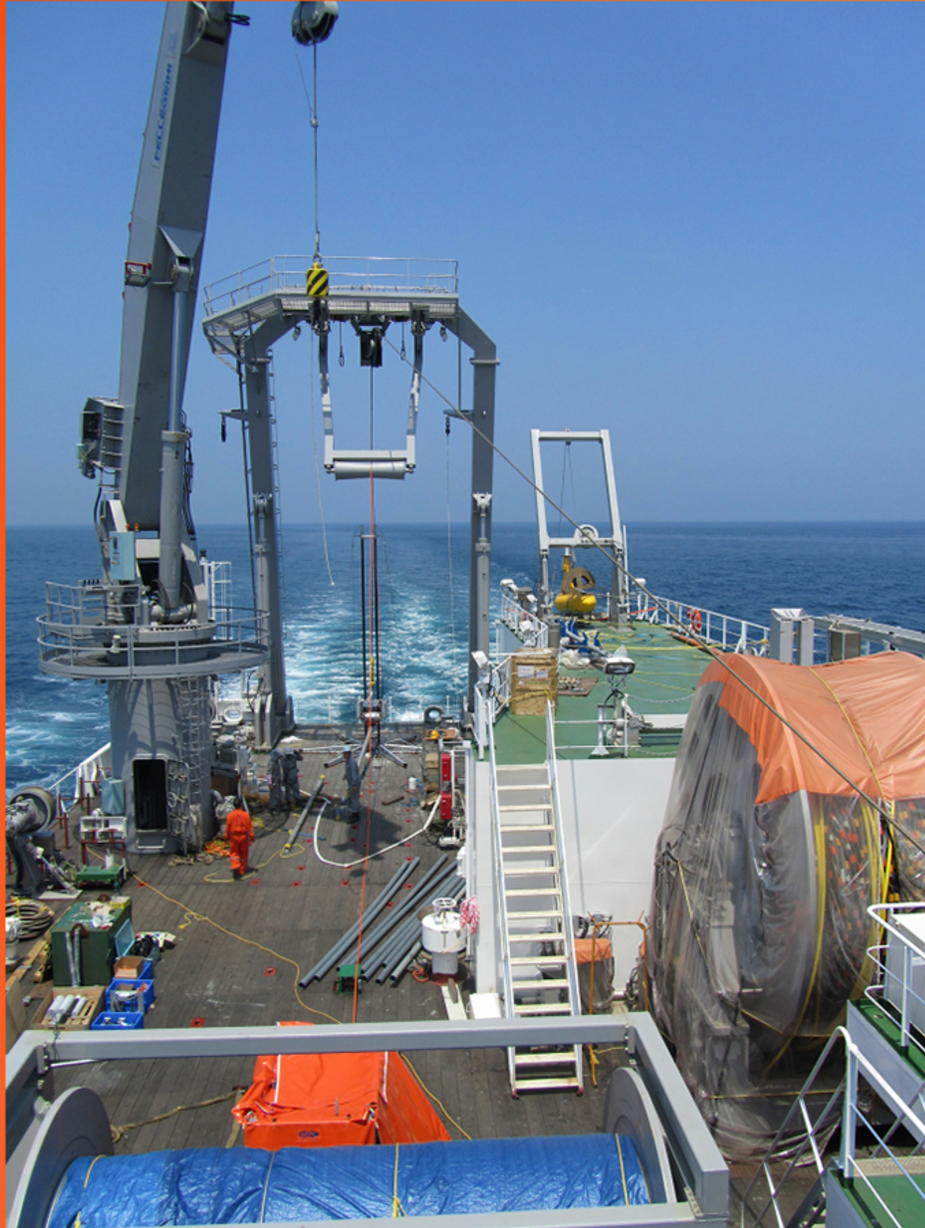
From the backdeck using A frame plus onboard winch