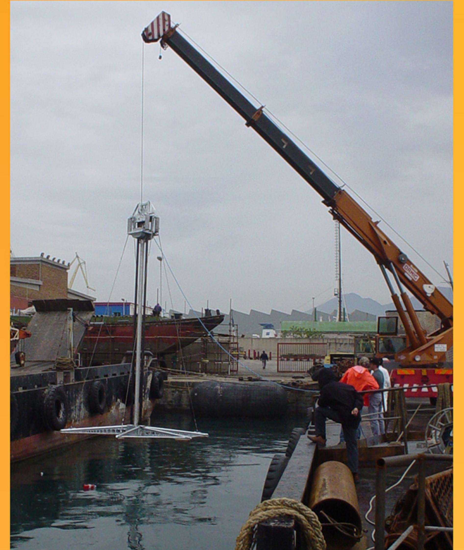
Deployment with Crane from barge