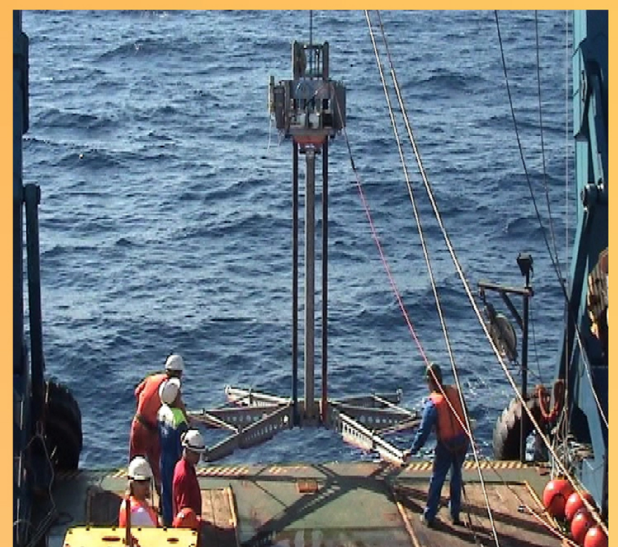
Pressure Compensated Model for depth over 250 m