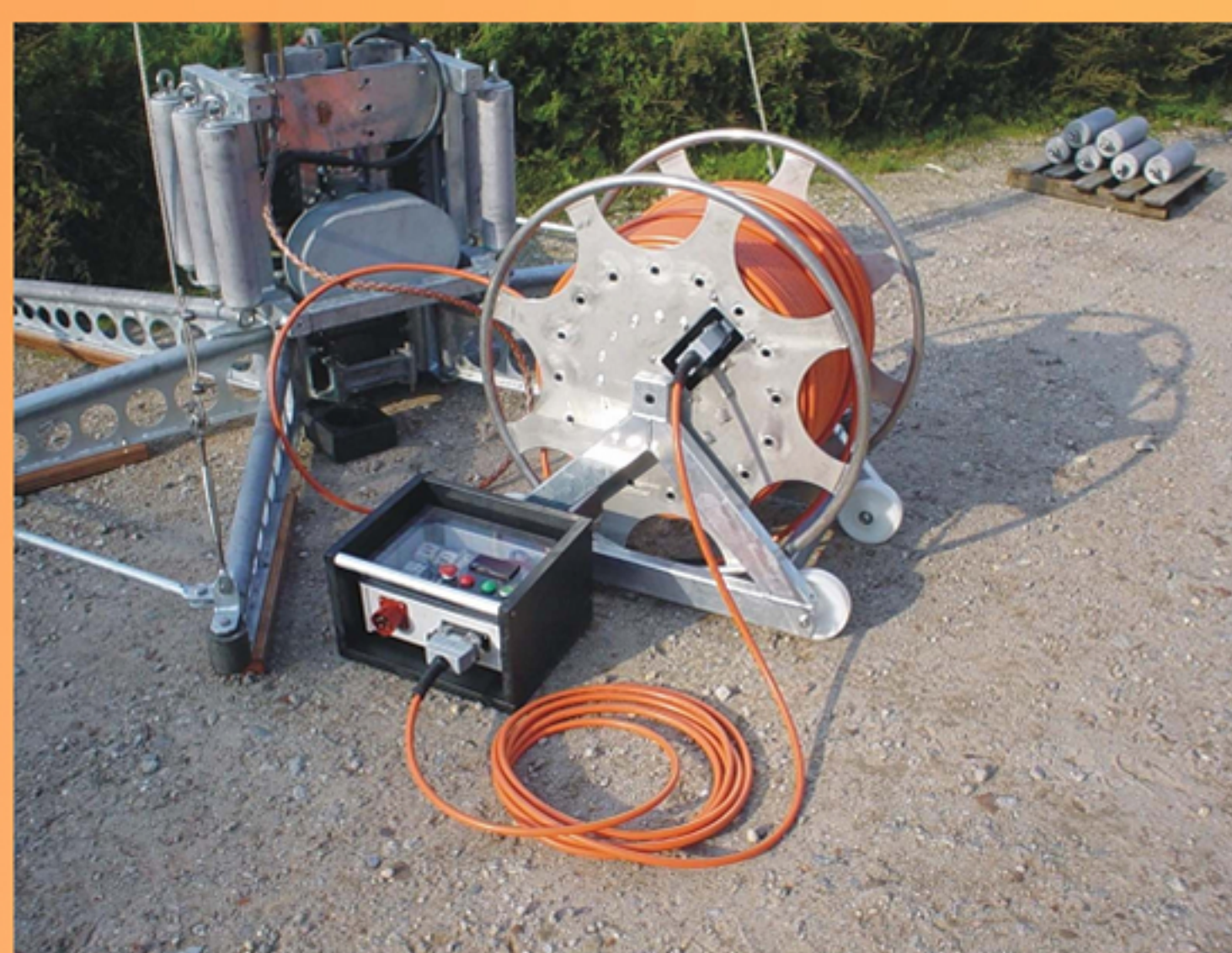
Cable Reel c/w Umbilical, Control Unit, Weights